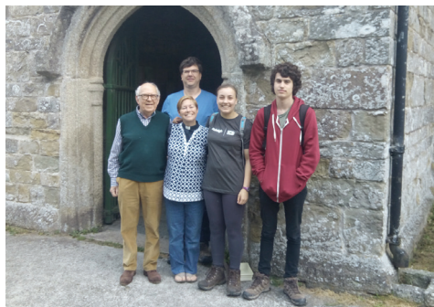
St James, St Kew