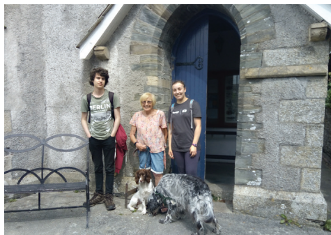
St Peter's, Port Isaac