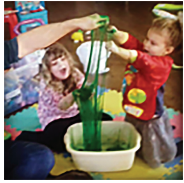
Exploring Slime at Mini Fingers

I am always very grateful to the volunteers who help to set up, prepare the drinks and snacks, chat with parents, play with the children and magically clear up afterwards.